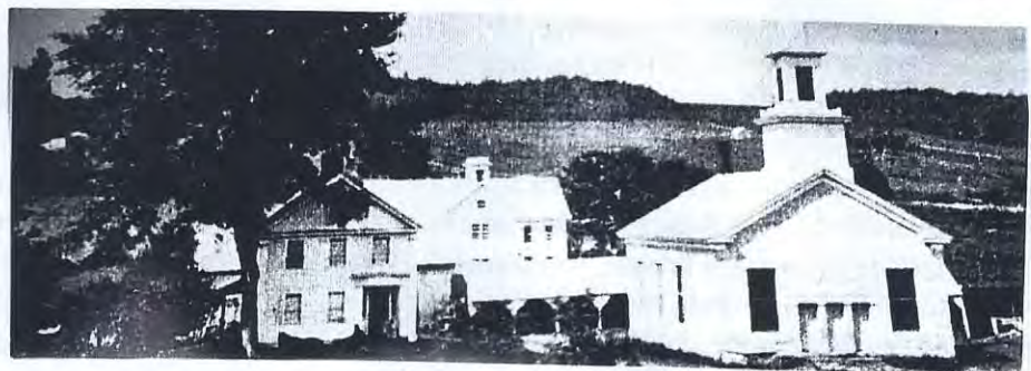
The Charleston Chew